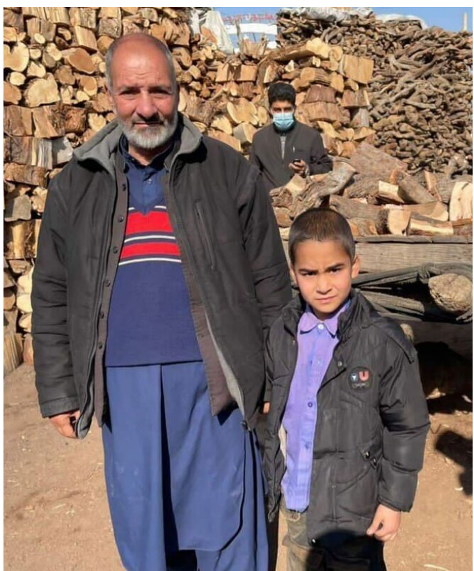
Firewood distribution is vital to Afghans for cooking and heating during harsh winters